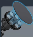
Common Magnetic Mount