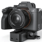
1/4" screw & 3/8" screw