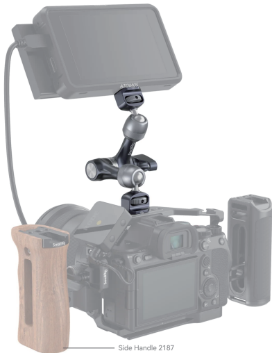
Side Handle 2187