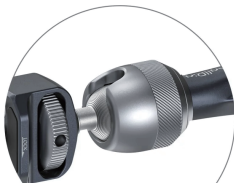
Increase the Slotted Range