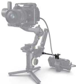
ZHIYUN CRANE 3S