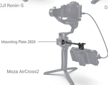
Mounting Plate 2826