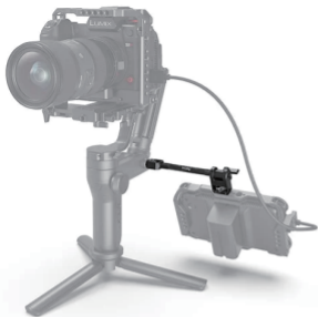
ZHIYUN WEEBILL LAB/WEEBILL-S