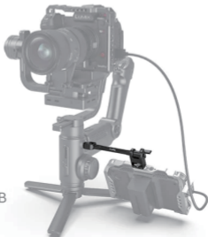
ZHIYUN CRANE 3 LAB