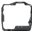
Nikon Z 9 Cage 3195