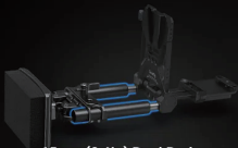
15mm (0.6in) Dual Rods (Included in the advanced kit)