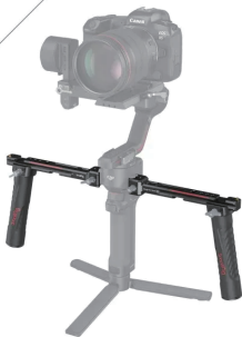
for DJI RS 3