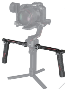
for DJI RS 3 Pro

Designed for DJI RS 2 / RSC 2 / RS 3 / RS 3 Pro / RS 4 / RS 4 Pro gimbal. Comes with cold shoes, 1/4"-20 and ARRI 3/8"-16 accessory mounts. Horizontal Adjustable & Upside Down Holding.