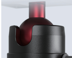
360° Smooth Ball Head