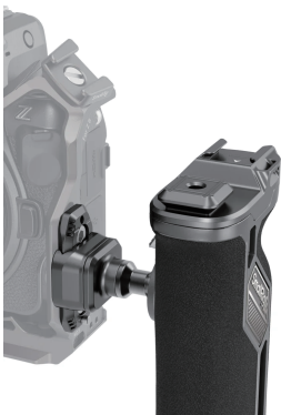
Cages without built-in H21 NATO Rail