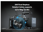
360° Dual Stepless Rotation Safely supports up to 15kg/33.1lbs