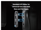
Standard H21 Slider for Universal Use with Both New and Old Cages