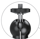
Anti-Slip Hinge Design