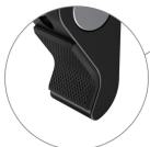
Built-in Anti-Slip Pads