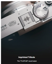
Imprinted Tribute The "FUJIFILM" sound wave