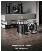
Interpretation of Classics Silver and black colors