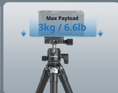
Ball Head Load: 3kg / 6.6lb